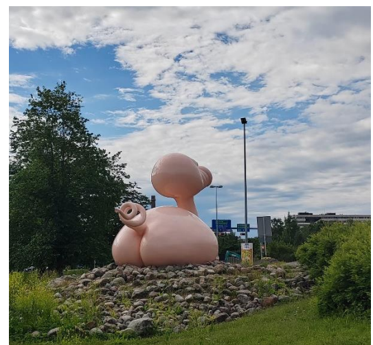
Posankka, or what I like to call the pig-duck, welcomes you to Turku.

Places like UFF, Maanantai Market etc sell second-hand clothes, shoes and bags. They are usually in quite good condition.