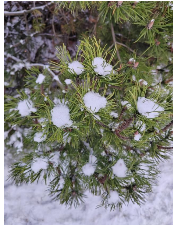
Snow in Turku comes overnight and melts in a few days, especially when it's a "warm" winter.

Some banks may have a problem with you depositing cash into your Finnish bank account. So, clarify with your banker at the start. They just need to know where your money is from so transaction receipts are handy. If not, it's okay to just let them know to expect a cash deposit into your account.