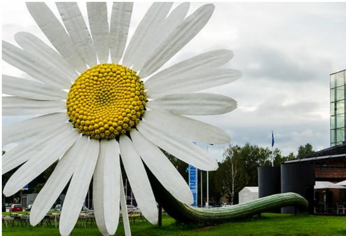
A huge daisy sculpture outside Forum Marinum (Navy museum), which is a very interesting museum to see in Turku.

*Tip 2: Make the police appointment ASAP because the wait time can be long. The police ID will allow you to have strong identification and you no longer have to carry your passport around. It makes your life easier.